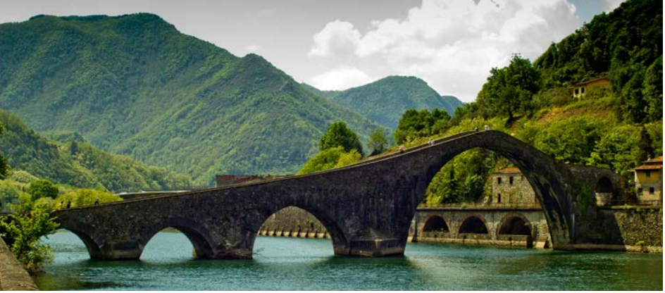
(continued on page 4)