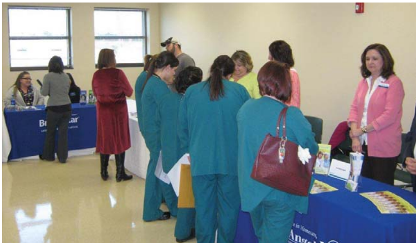
Health Care Career Expo