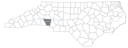
THE GC SERVICE AREA, NC

Gaston College (GC) creates a significant positive impact on the business community and generates a return on investment to its major stakeholder groups—students, taxpayers, and society. Using a two-pronged approach that involves an economic impact analysis and an investment analysis, this study calculates the benefits received by each of these groups. Results of the analysis reflect fiscal year (FY) 2019-20.